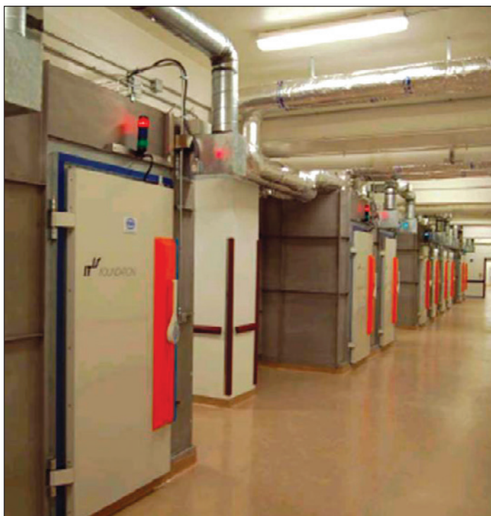
Chambers at the IIT Research Institute in Chicago where the studies took place.

Exposure to RFR began in the womb for rats and at 5-6 weeks old for mice. The RFR exposure was intermittent, 10 minutes on and 10 minutes off, totaling about nine hours each day. The RFR levels ranged from 1.5 to 6 watts per kilogram of body weight in rats, and 2.5 to 10 watts per kilogram in mice.